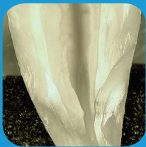
GENTLEWAVE ® PROCEDURE

Standard treatment cannot reach all the way into the root canal.